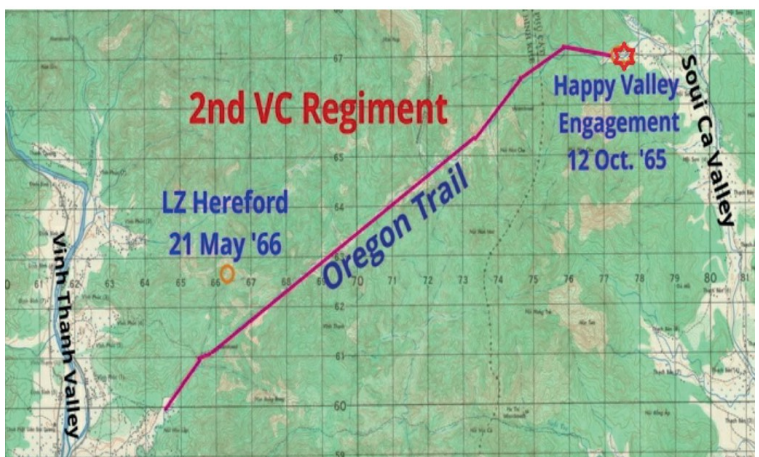
Exfiltration of 2d VC Regiment Following Happy Valley

When they engaged B Company in SHINY BAYONET on October 12th 1965, the VC were fighting a delaying action while the bulk of their unit escaped west up the "Oregon Trail." Their tactics were well planned and implemented (Map).